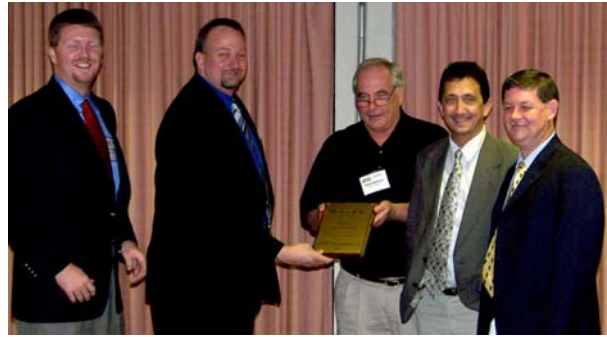
Representatives of Apogee Coal Company accept the 2009 Outreach Award

and Career Opportunities. Through these efforts Apogee Coal Company has been and will continue to be a Good Neighbor.