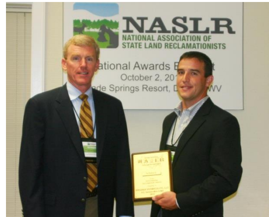
Virginia Vermiculite, LLC accepts the 2012 NASLR Reclamation Award in the non-coal category.