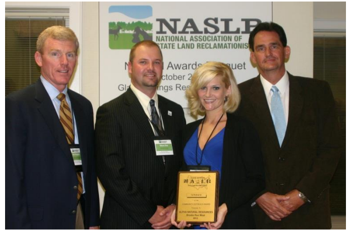
Representatives from Alpha Natural Resources accept the 2012 Outreach Award.