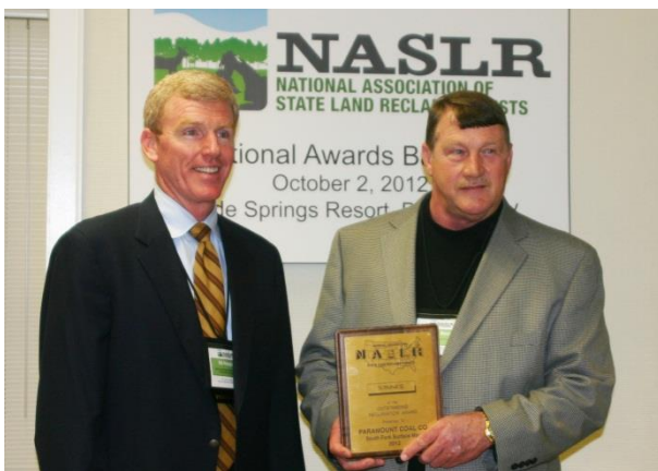
Representative from Paramount Coal Company accepts the 2012 NASLR Reclamation Award.